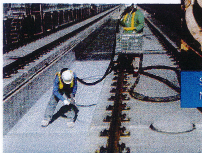
Omoi Bana Bridge, Japan Railways