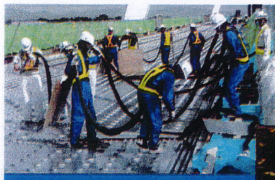
Mihara Ohashi Bridge, Japan