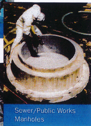
Sewer/Public Works Manholes

The Leader in Diversified Protective Coatings